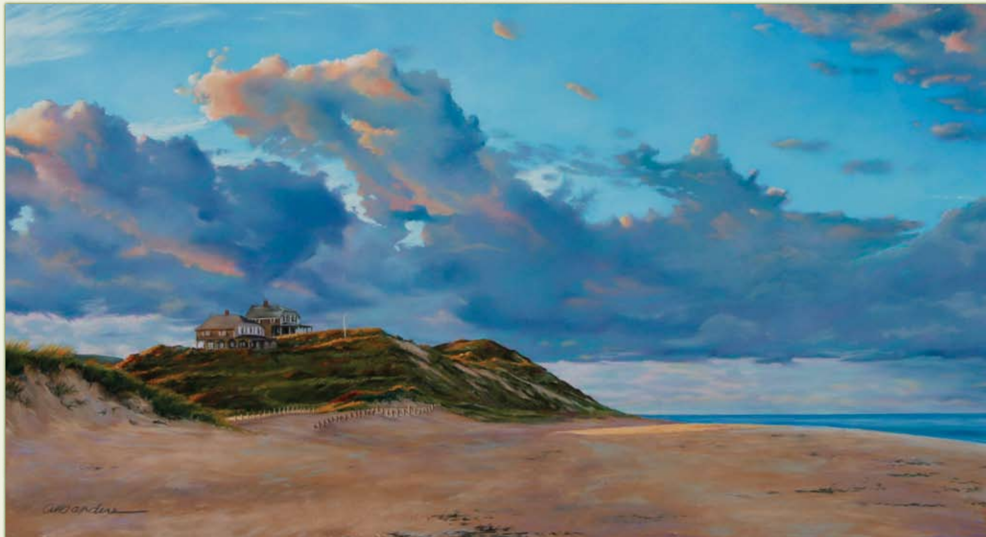
November Sky (12x22)

She painted the piece on Wallis pastel paper and used primarily Sennelier pastels for the fall brush and Winsor & Newton pastels for the